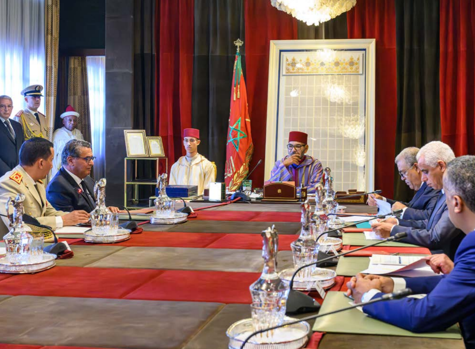
His Majesty King Mohammed VI, chairing a working session dedicated to examining the situation following the earthquake, September 9, 2023