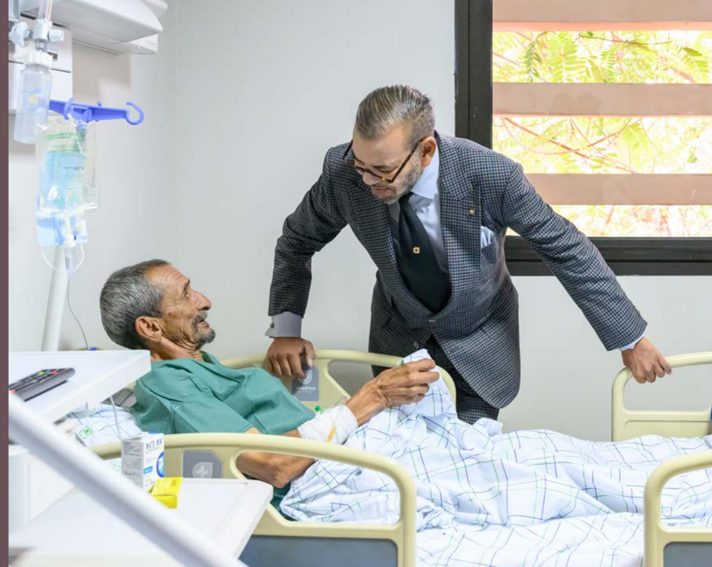
His Majesty King Mohammed VI, at the bedside of the earthquake injured at the CHU of Marrakech, September 12, 2023.

An exceptional national mobilization led by His Majesty King Mohammed VI