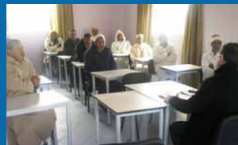
entre for Agricultural Development - LaajajraAbed