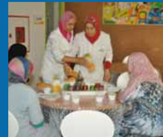
UM - CHU Ibn Rochd - Casablanca Socio-Sports Complex and Youth Training - Ain Nokl